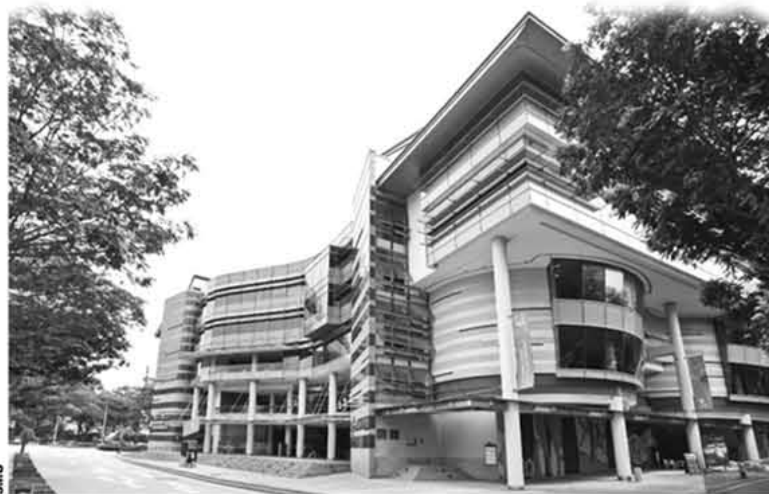
In control of heat and light since 1981, Rollite™ Rollscreens is engineered and built to last, withstanding the vagaries of daily use. Its perfect balance of style and performance comes with a plethora of choices, customizable for every project.

All ways in Control Intelligent, efficient and simply chic ROLLITE ROLLSCREENS