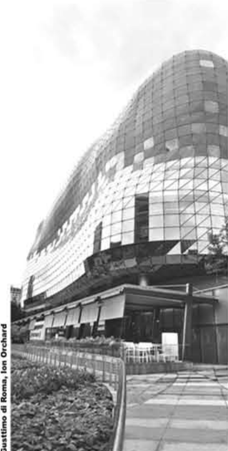
Rollite™ Rollscreens. It's cost efficient and effective. All ways relevant, all ways in control of heat and light. Rollite™ Rollscreens: not just for windows, but also for glass roofs with Rollite™ Automated Skylight System.